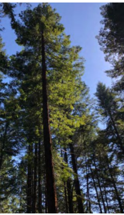
For more information about Zig, please see www.nifdi.org/zig