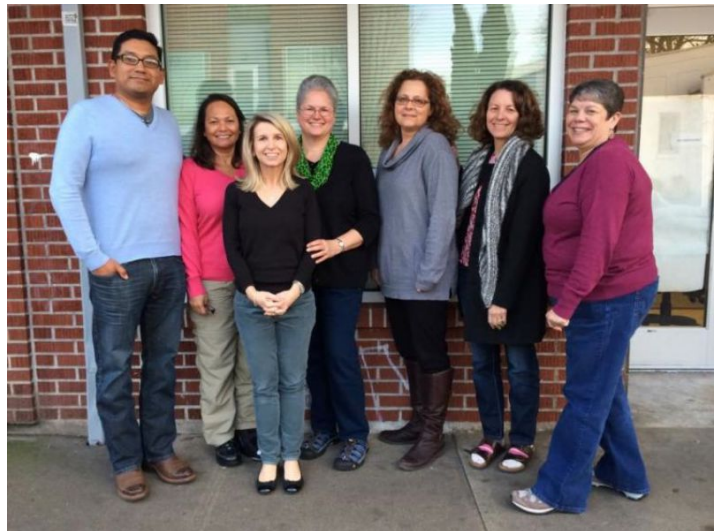
New Implementation Managers gathered in Eugene for an extensive training in preparation for the upcoming work in Australia.

For more information on how NIFDI can help your school ensure success for every student with DI, visit us online to learn how to get started .