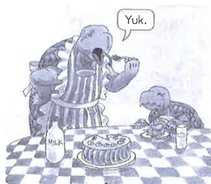
Bitter Butter Part Three

The little turtle tasted the cake. Did she like the taste? No. She said, "Mom, this cake is not sweet. It is bitter."