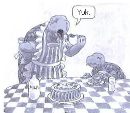
Bitter Butter Part Three

The little turtle tasted the cake. Did she like the taste? No. She said, "Mom, this cake is not sweet. It is bitter."